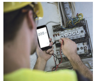
Electric Power Inspection